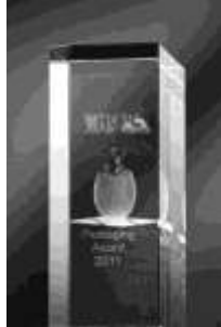
The trophy 2011