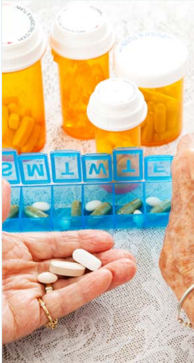
Placing prescriptions in reminder pill boxes can increase the risk of dosing errors and removes child-resistance packaging features.